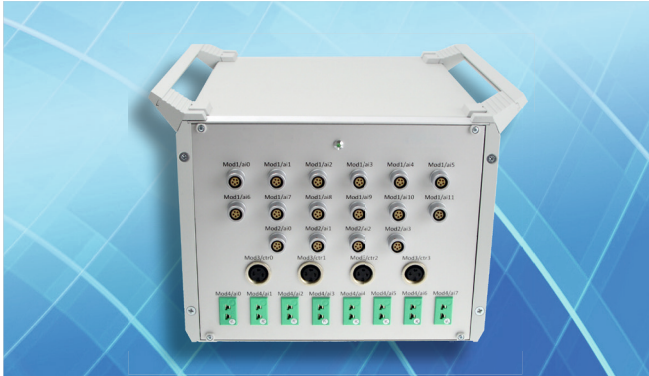
Front panel of the mobile measurement data recording system, with the connections for the different measuring modules