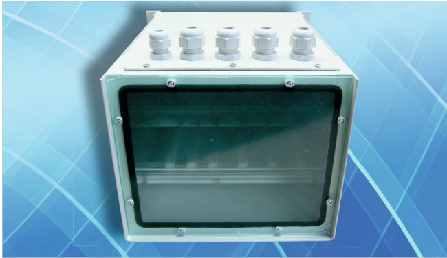
Front view of the closed chassis with five PG screw connections on the cover plate and Macrolon plate for the front covering